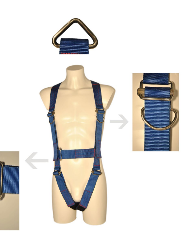
Compliant with Standard EN 250:2006